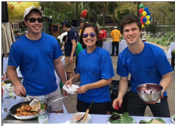
Sodexo supported the College of Medicine’s 2 nd annual “Chopped” competition.