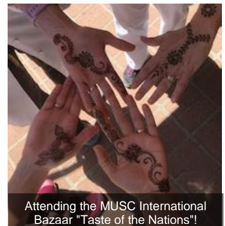
Attending the MUSC International Bazaar "Taste of the Nations"!

Learn more at https://tinyurl.com/ya3pskmn