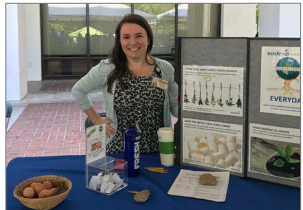
MUSC’s Earth Day celebration showcased how Sodexo exhibits sustainability at MUSC every day.